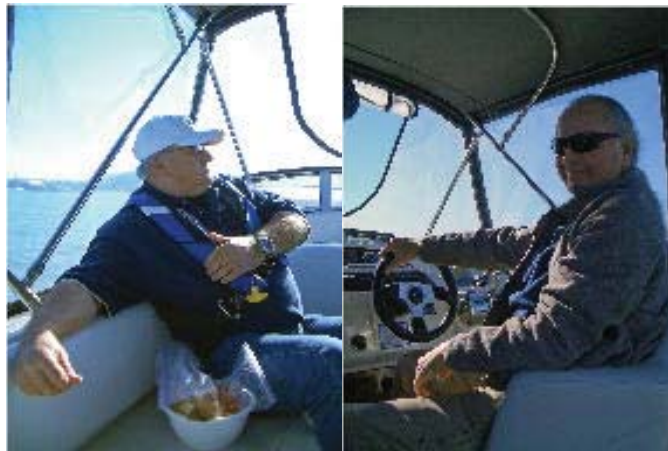
Women's Sailing Convention, 2/7/2015