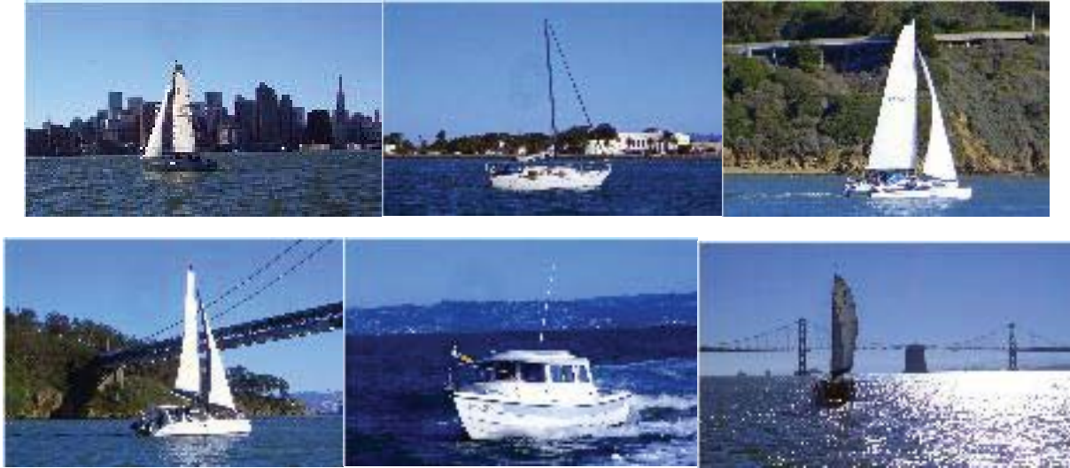
Around the Islands (YBI & TI) on New Year's Day, 1/1/2015