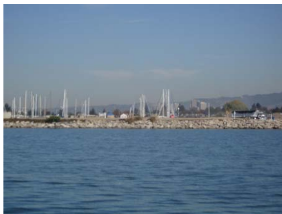
Native Sun enters Ballena Bay (City of Oakland in the Background.)