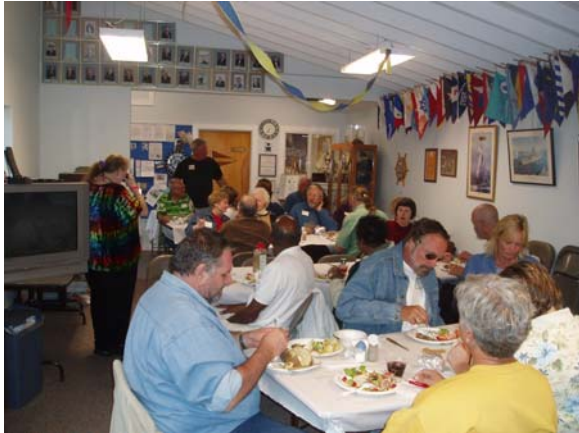
Sold out Steak and Lobster Fleet Week Dinner welcomed Encinal, Ebony, Village West and Caliente Island Yacht Clubs.

TIYC had an opportunity to honor the members that have kept the Club going as well as new members that have given us added vitality. Thanks to members of the Delta Sportsmen's Yacht Club, Encinal Yacht Club, Ebony Boat Club, and the Village West Yacht Club, the dinner was sold out three days prior to the event!