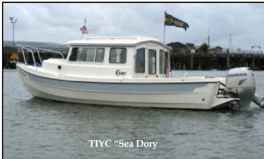
TIYC "Sea Dory"