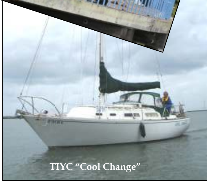
TIYC "Cool Change"