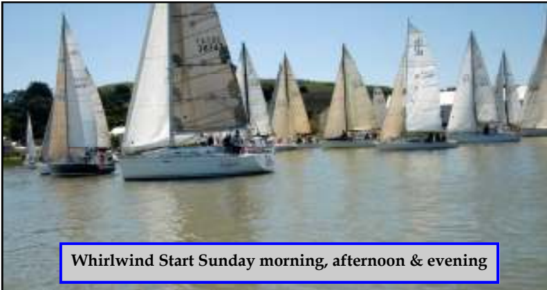
Whirlwind Start Sunday morning, afternoon & evening