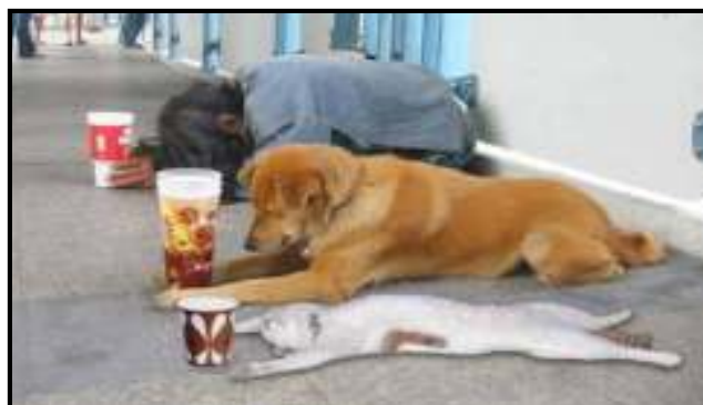
Market Street, San Francisco

26 th ( 7:00pm ) B&B ( Calendar Planning /Nominations )