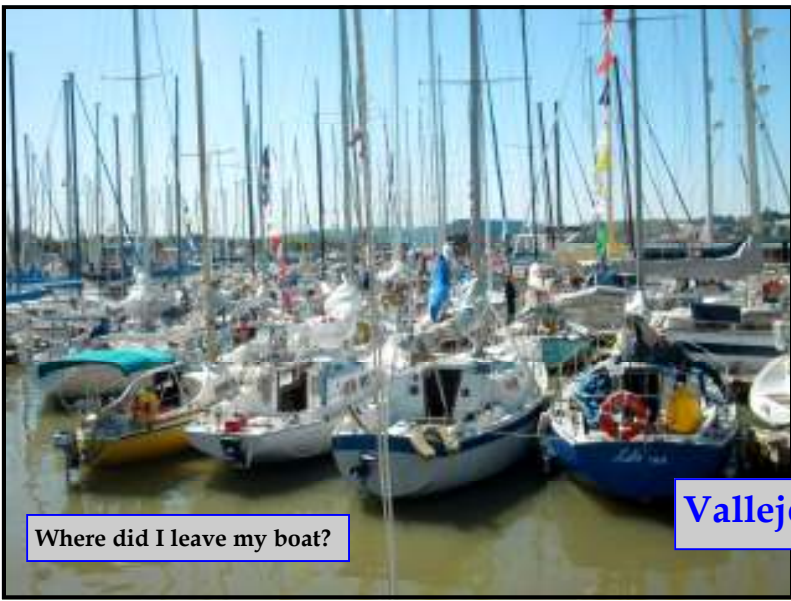
Where did I leave my boat?